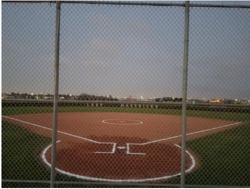
Home of the PMHS Lady Mavs

For the past two years, PMHS has played multiple games on campus, and look forward to holding camp here. Our camp and softball program is growing rapidly.