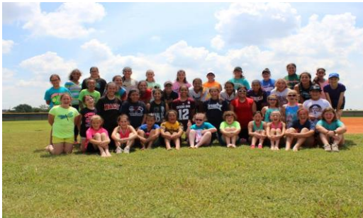
Maverick Softball Campers

We love our campers and look forward to helping them grow physically, mentally, and emotionally.